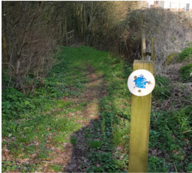
Public foot path sign on the north side of the A421

The small path arrow has been re-set to point along the A421 when the path in fact crosses the A421 at this point to join BUC/13/3