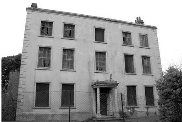
Prebend House, Hunter Street